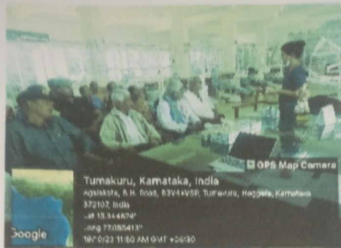
Denture Maintenance instructions given by the Pg