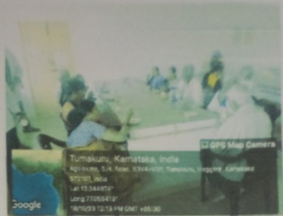
Refreshments were provided