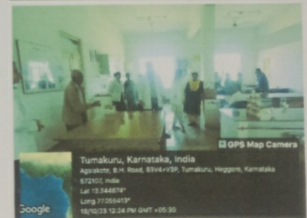
Patients were made to play fun games

19/10/23 PROF., & H.O.D Department of Prosthodontics Crown and Bridge SRI SIDDHARTHA DENTAL COLLEGE AGALAKOTE, B. H. ROAD, TUMKUR-572102