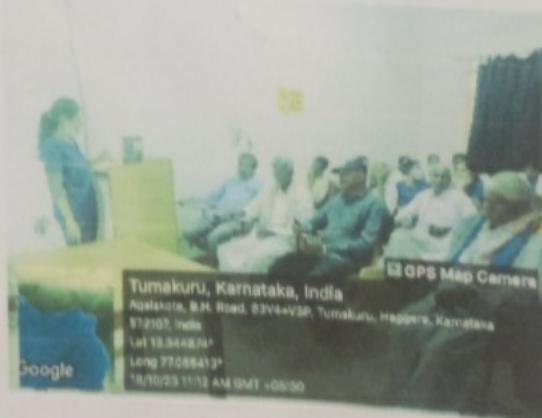
Video presentation done by Pg's

19/10/23 PROF. & H.O.D Department of Prosthodontics Crown and Bridge SRISIDDHARTHA DENTAL COLLEGE AGALAKOTE, B. H. ROAD, TUMKUR-572102