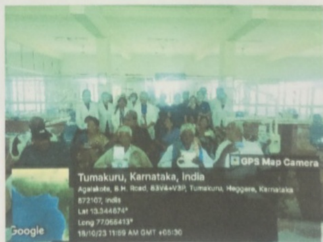
Distribution of denture boxes and denture cleansers

22/10/23 PROF., & H.O.D Department of Prosthodontics Crown and Bridge SRI SIDDHARTHA DENTAL COLLEGE AGALAKOTE, B. H. ROAD, TUMAKURU